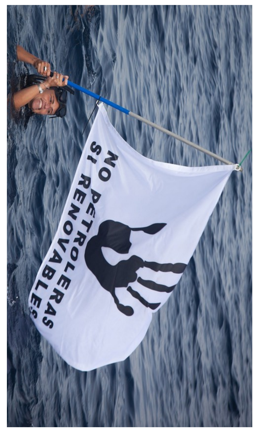
Figure : I "No to petroleum drilling, yes to renewables" (Bjork, 2015).