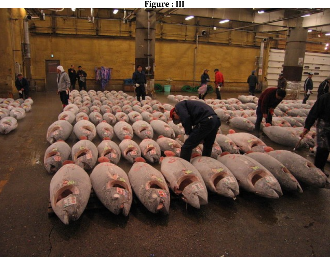
Frozen tuna at the Tsukiji wholesale market in central Tokyo (Booth, 2014).